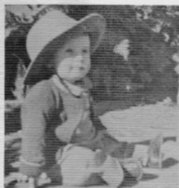
18. But occifer, I'm just resting!