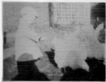
10. All right you guys, now get in there and fight.