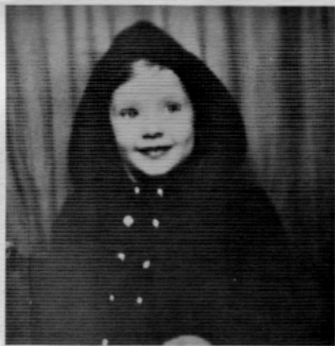
11. Me, a star?