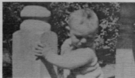
14. Oh! I can't bear to look!