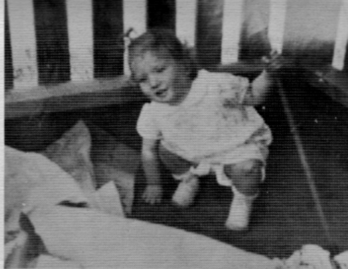
12. No dear, that's for the kitty!