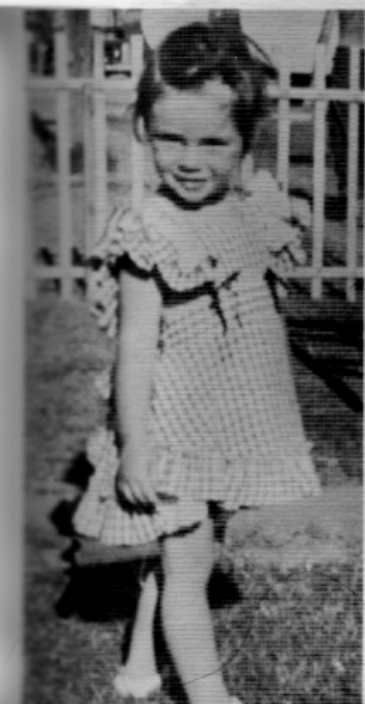
17. But darling, of course it's a Dior!