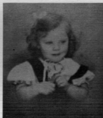
15. Oh, I get so nervous at these games!