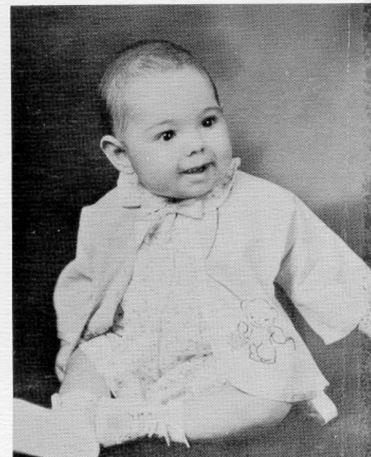
9. and she's only a sophomore, you say?