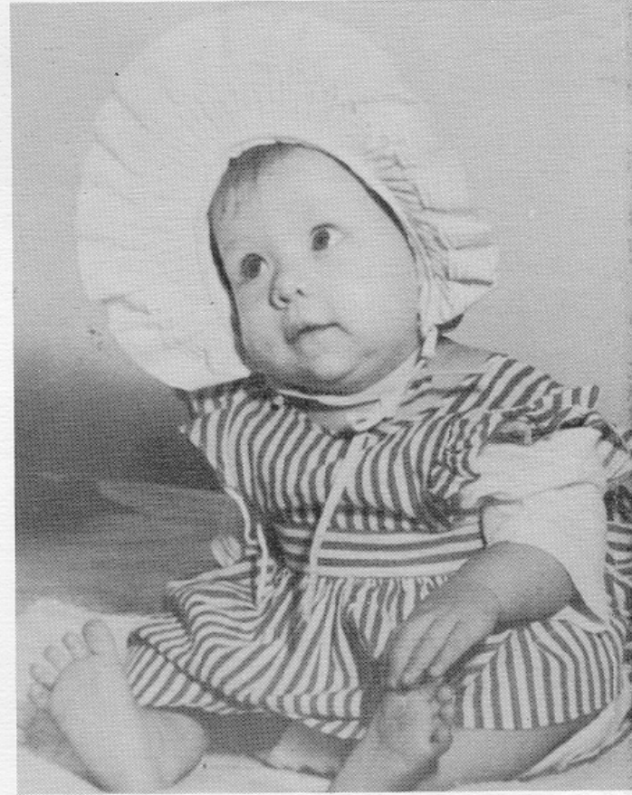
3. This little piggy went to market . . .