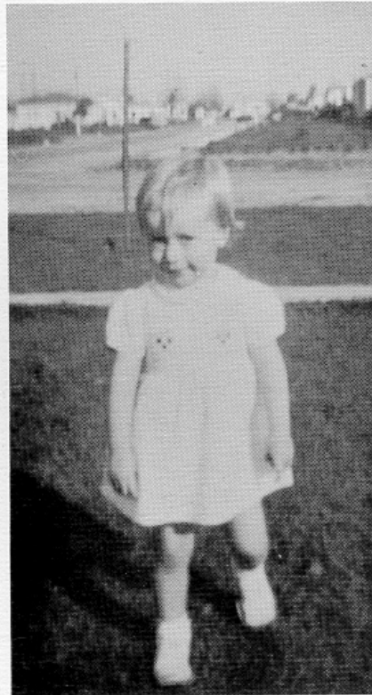
5. Come on you kids—why don't you yell?