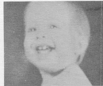
6. I'm just so pleased to be appearing here in Vegas.