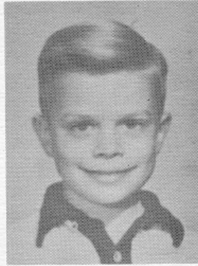
2. . . . and he hasn't changed a bit.