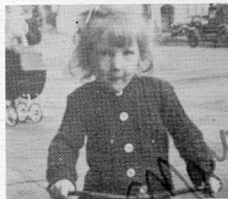
8. Oh, I just hate this free-way traffic.