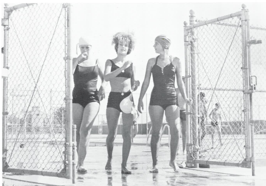
Who is your hairdresser?