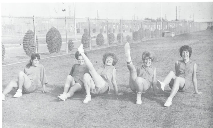
"Do you think he notices us?"