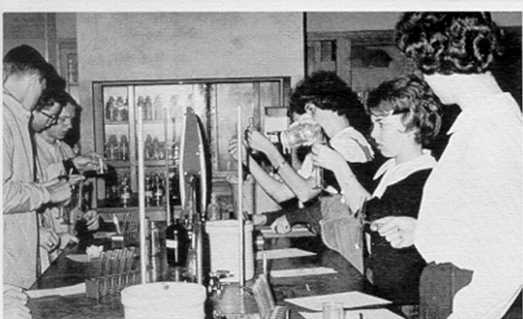
Three mosquito ears, two bees' knees, seven gnat's ankles, and then jiggle till done.