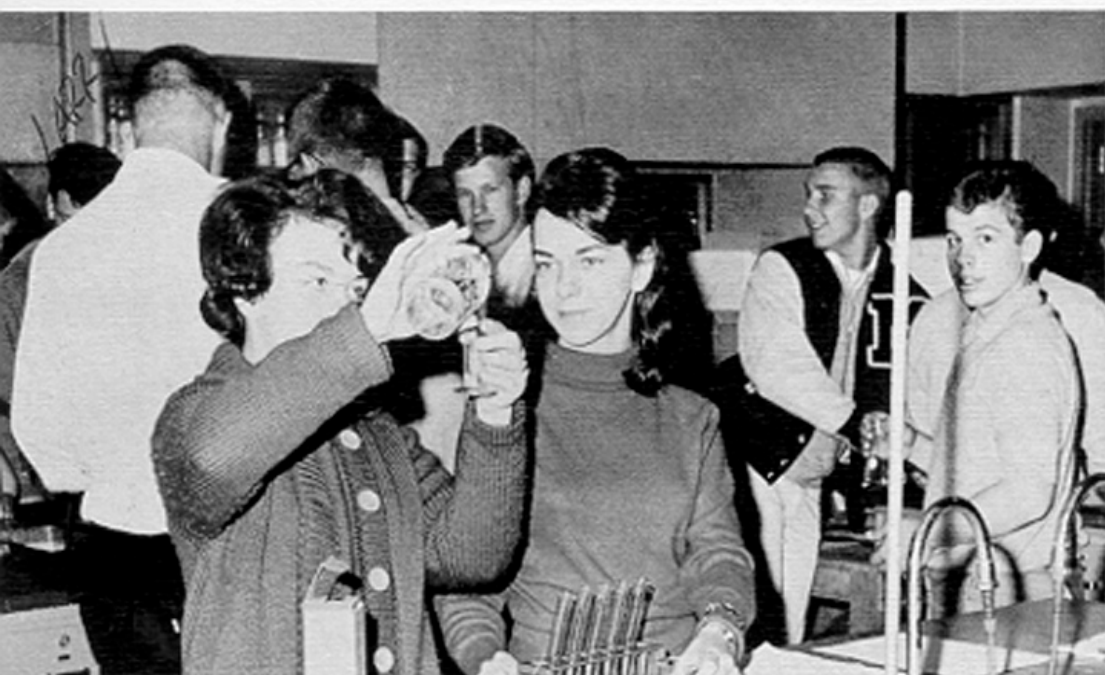
168 Hey, this looks pretty . . . heck with the instructions.