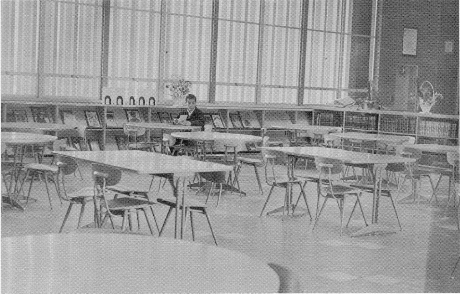
Overcrowded conditions in the library during final's week force many students to work in congested little groups.