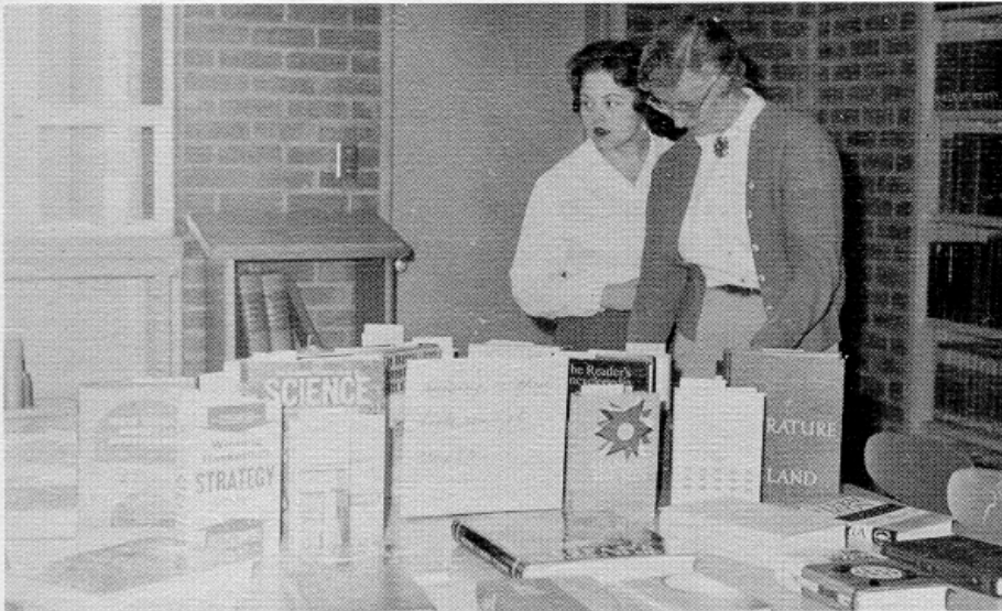
Are you sure it's alright to tear pages out of the Encyclopedia?

It has been said that books are the key to knowledge. Because today's society stresses the well-read individual, McLane has added approximately three hundred new and challenging books.