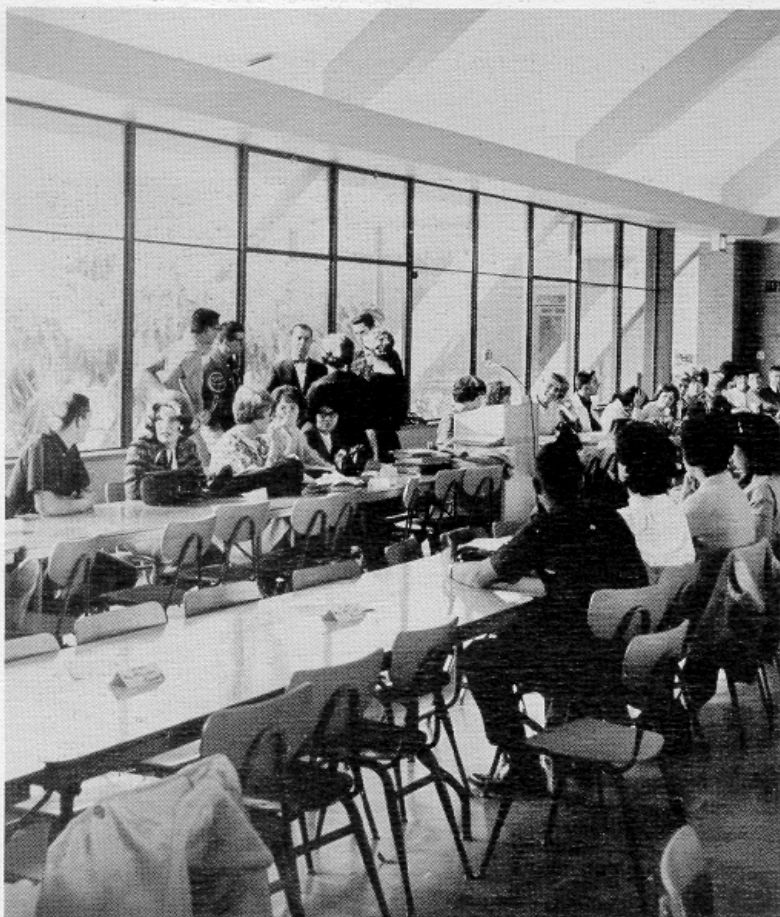
"Sweet Adoline . . ."

The Advisory Assembly, the student body lawmaking organization, is composed of representatives and their alternates from the sophomore English classes, the junior history classes, and the senior civics classes. McLane's student body vice president is the presiding officer. If the vice president is not present at the meeting, a speaker pro-tempre, selected by the assembly, serves as chairman. At joint meetings of the Executive Council and the Advisory Assembly, the student body president presides. This group deserves a vote of confidence for its work in keeping justice at McLane.